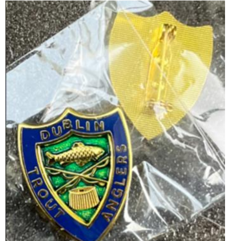
Fresh stock of DTAA pins available

The committee upgraded our DTAA club pins this year and now have a fresh stock of new pins. If members would like to get some of the new pins, or DTAA ties just select what