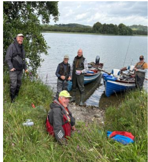
A welcome lunch break, Elvery Cup, Lough Lene, 26th July 2025