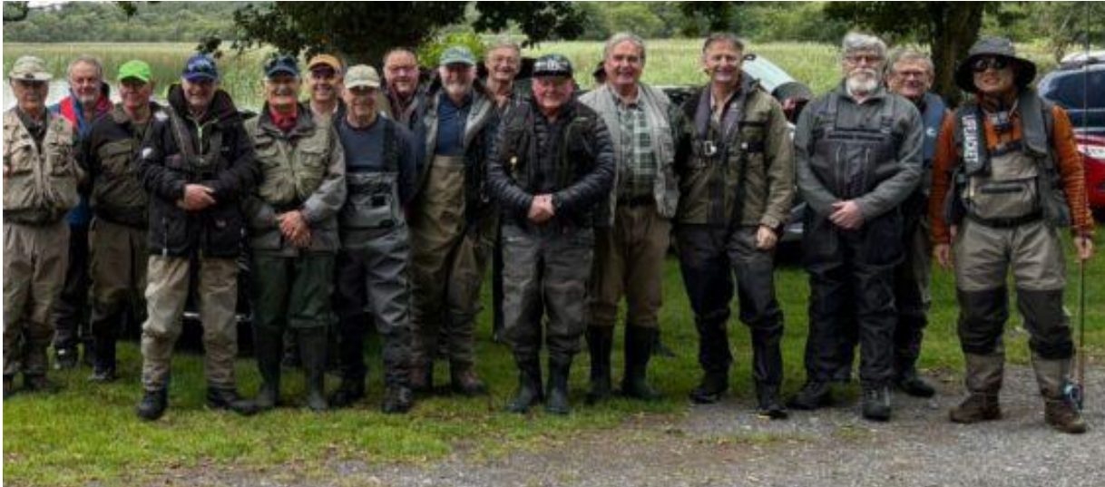
Elvery Cup, Lough Lene, 26th July 2025, 'right hand side'