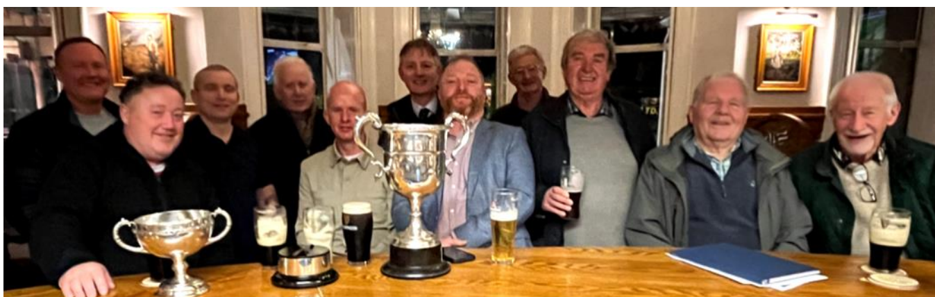
Some members enjoying the hospitality at the Lucan Spa Hotel after the January 2025 DTAA AGM