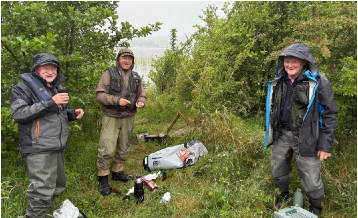
' a liquid lunch' Lough Lene style, in the rain, LM Byrne Cup, 14th June 2025