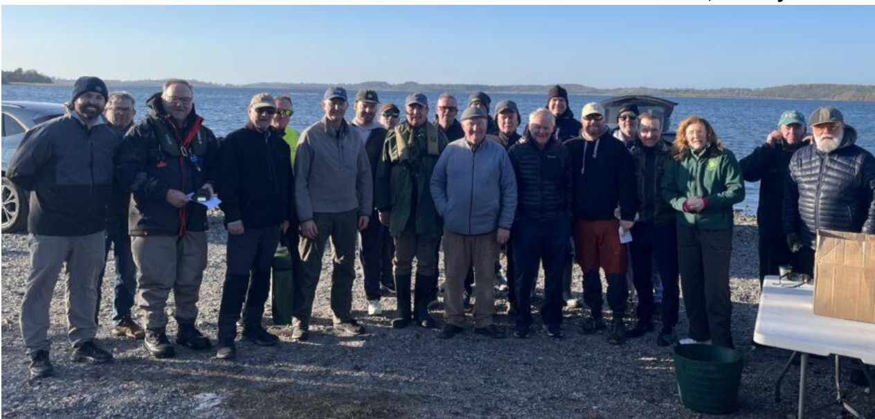
After the weigh-in, Pasker Cup, Lough Owel, 6th April 2025