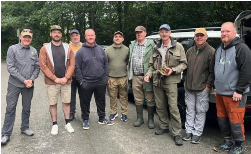
After the weigh-in, Ryder Cup, Bohernabreena, 9th September 2025