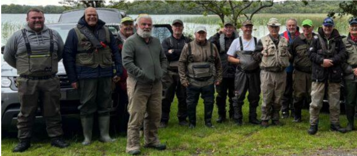
Elvery Cup, Lough Lene, 26th July 2025, 'left hand side'