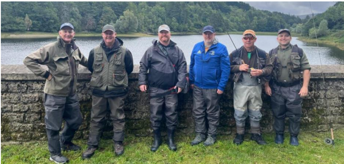
Getting ready for 'kick off', Bohernabreena, Ryder Cup, 9th September 2025