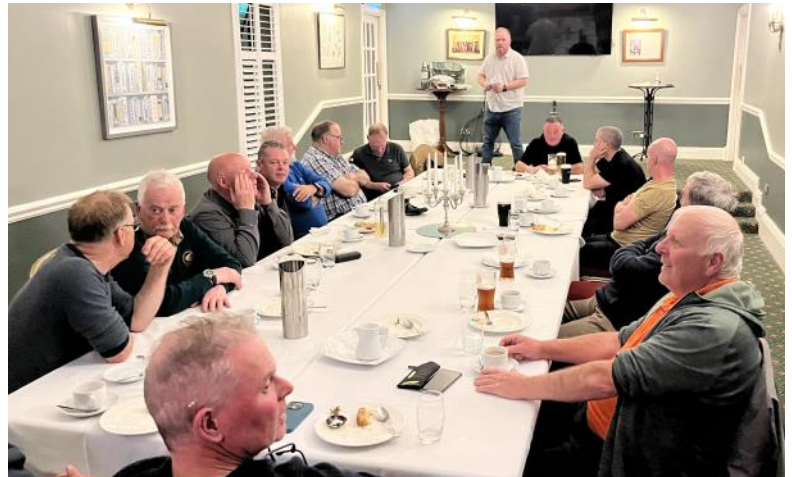
DTAA end of season dinner in Greville Arms Hotel, Mullingar after McCarron Cup, October '25