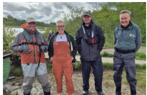
Great catch up between DTAA and Conn & Cullin Anglers