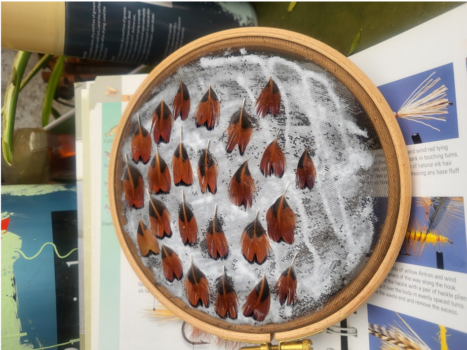
John's prepared tent wings drying on fabric tights secured in crochet band.

A system to help in making tent wings for sedges