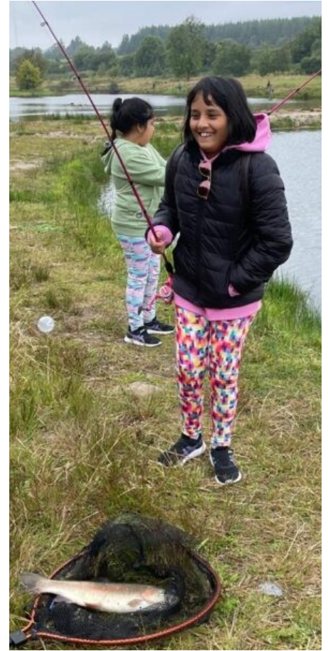
to hook a fish with many of our younger competitors using the bubble and fly with the others preferring a fly rod, and some catching fish this way for the first time!