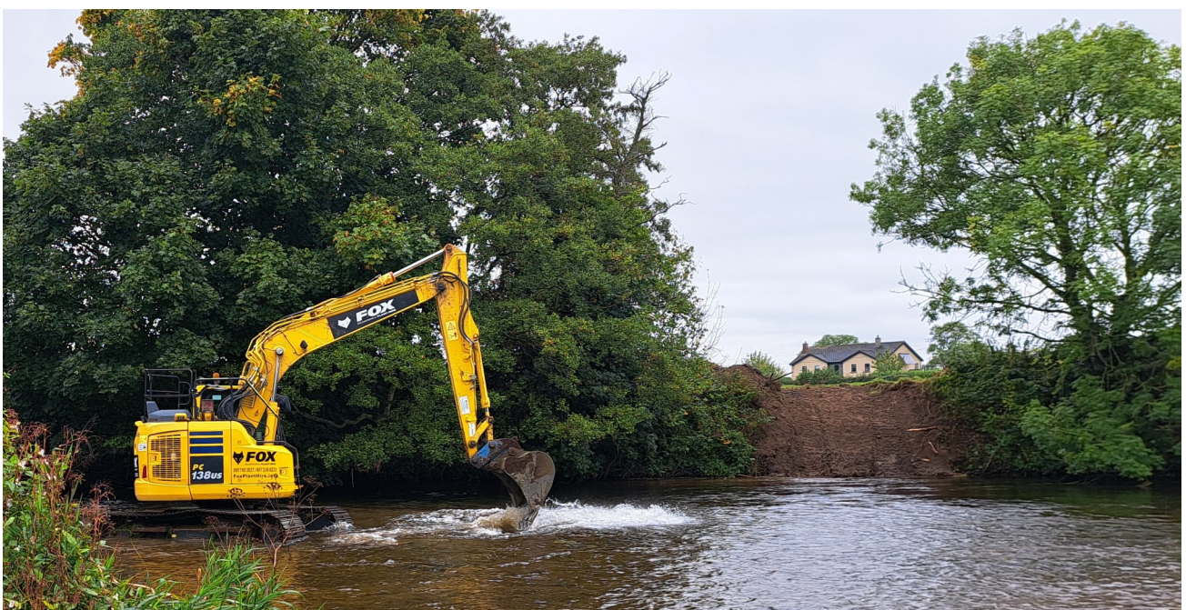
IFI Contractor working in Paddy's Strand, September 2024