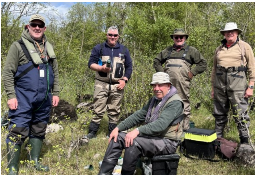
Conn & Cullin and DTAA Anglers taking a well earned break