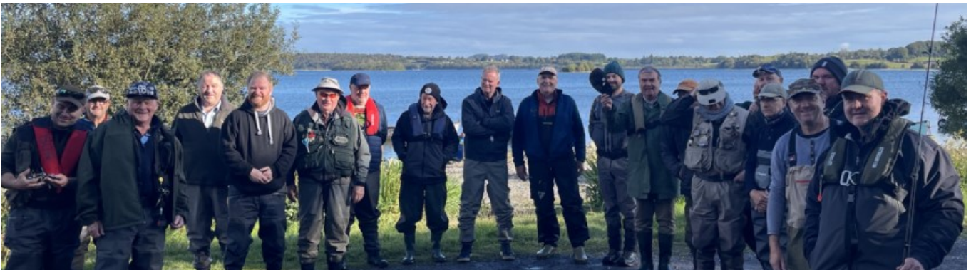
Mc Carron, Lough Owel, 28th September '24