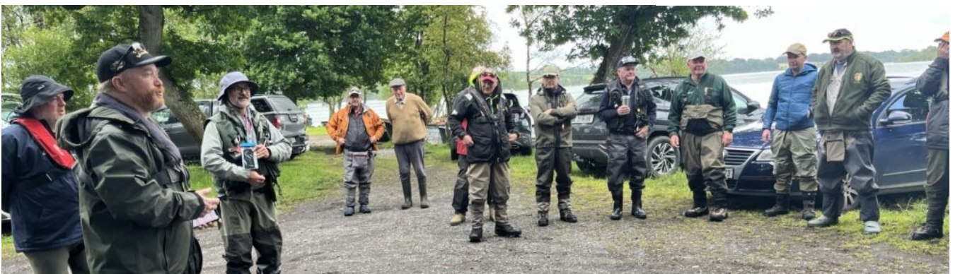
LM Byrne Cup, Lough Lene, 15th June '24