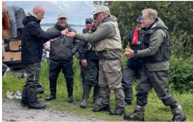
Dishing out the sun cream at the Ian Rowan Trophy, Lough Owel, 6th July 24.