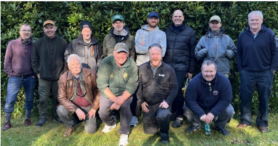
Anna Livia Trophy, Bohernabreena, 17th April '24