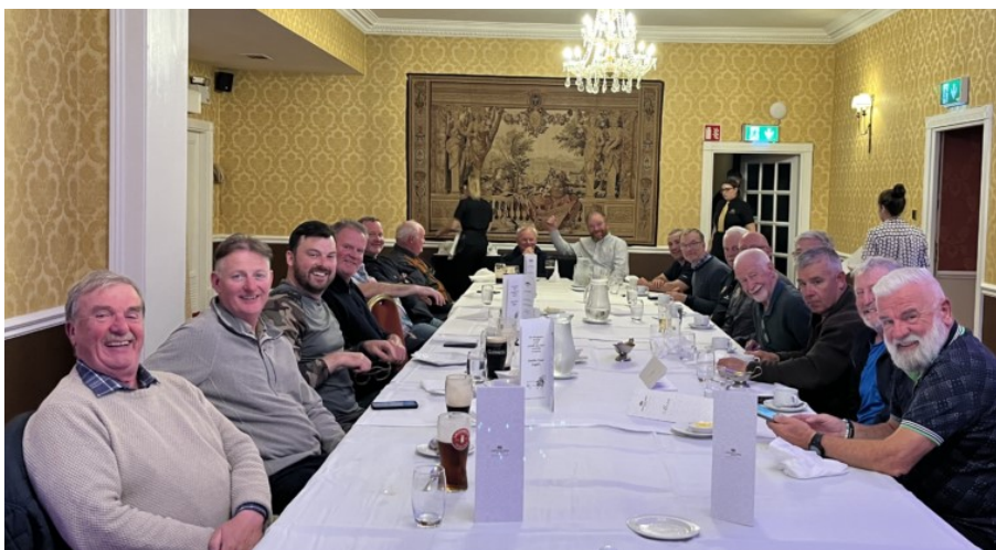
DTAA end of season meal in Greville Arms Hotel after McCarron Cup, September '24