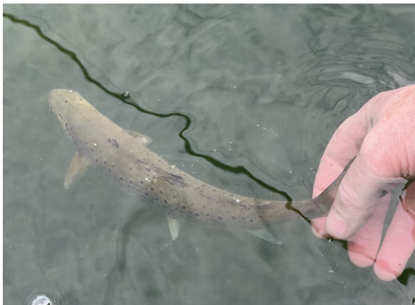
Full finned Lough Owel wild brownie, 2024 Leinster Championship.