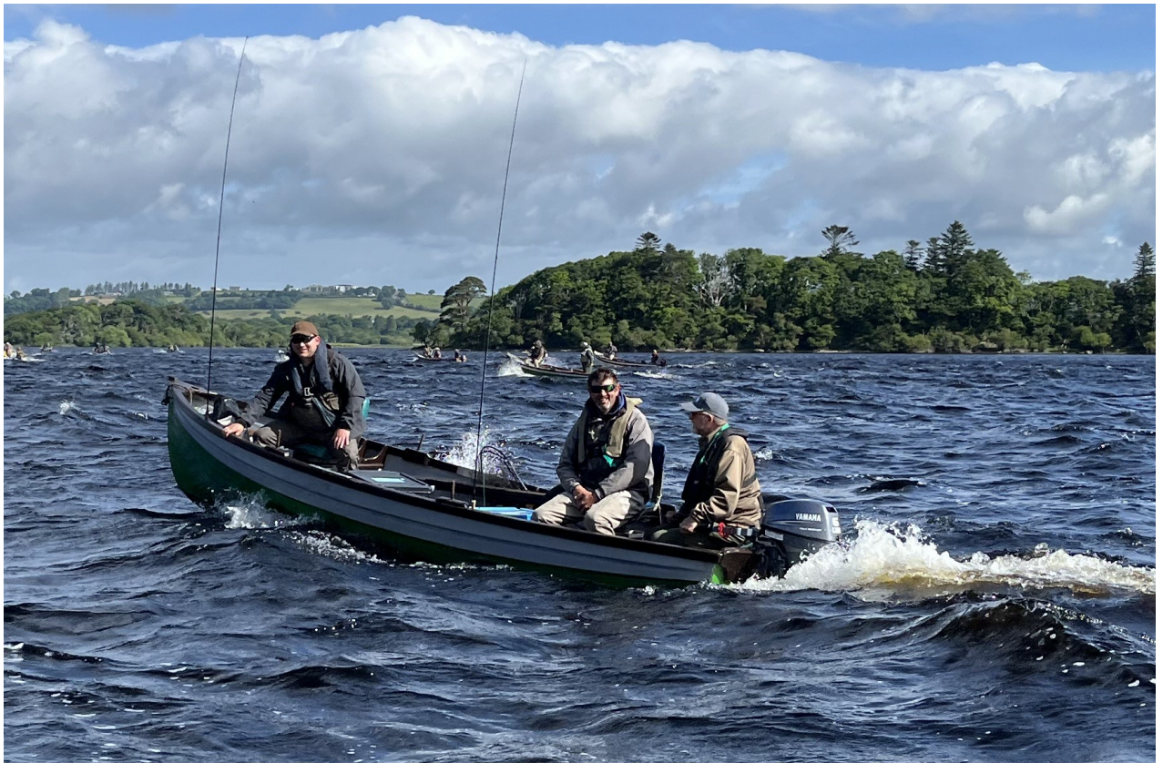
Windy conditions, National Final Lough Lein, Killarney May '24.