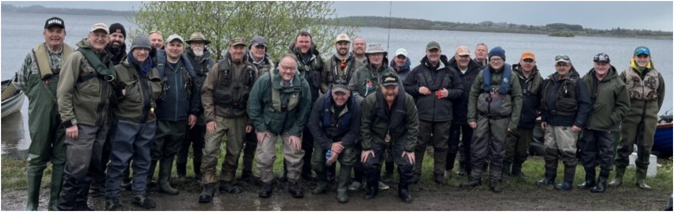
Pasker Cup, Lough Owel, 13th April '24