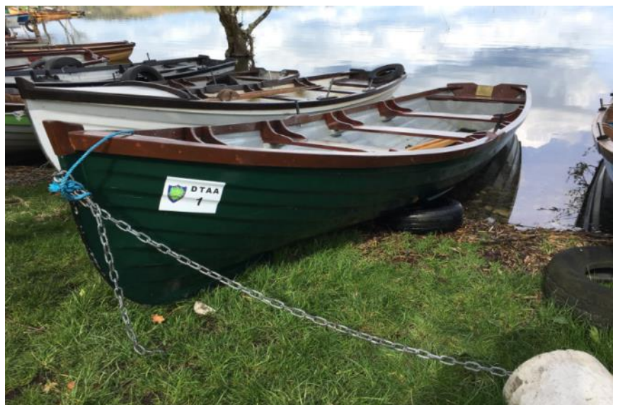
This is how to leave the DTAA boat securely on the shore