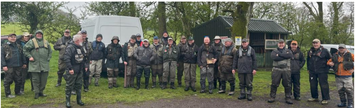
LM Byrne Cup, Lough Lene, 22nd April '23