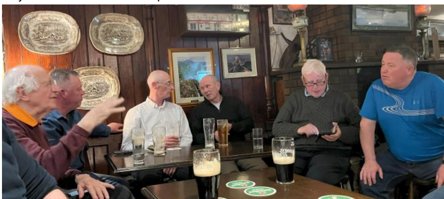
Solving the Problems of the World and analysing what went wrong for the Dubs!