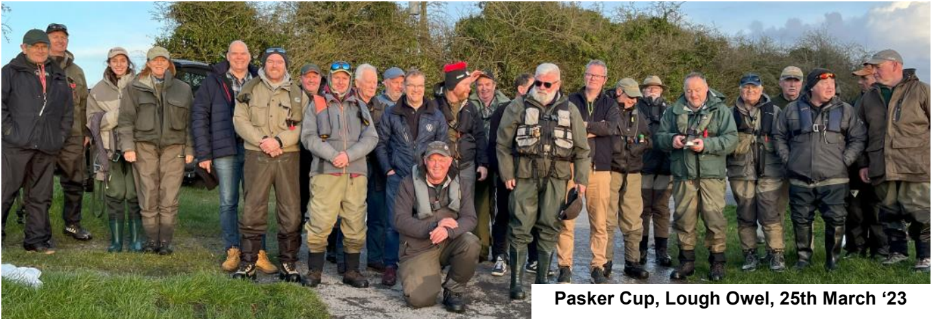
Pasker Cup, Lough Owel, 25th March '23