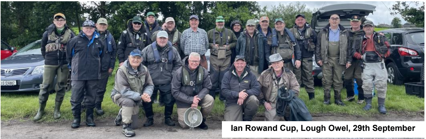
Ian Rowand Cup, Lough Owel, 29th September