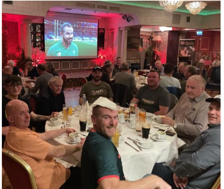
Enjoying the World Cup Rugby at the end of season dinner, Greville Arms Hotel, following Mc Carron Cup 23rd September '23.