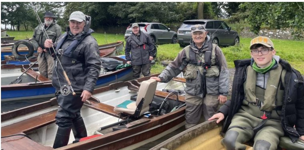
The Graveyard lunch stop, Lough Owel- Diller, it's a boat not the catwalk!!