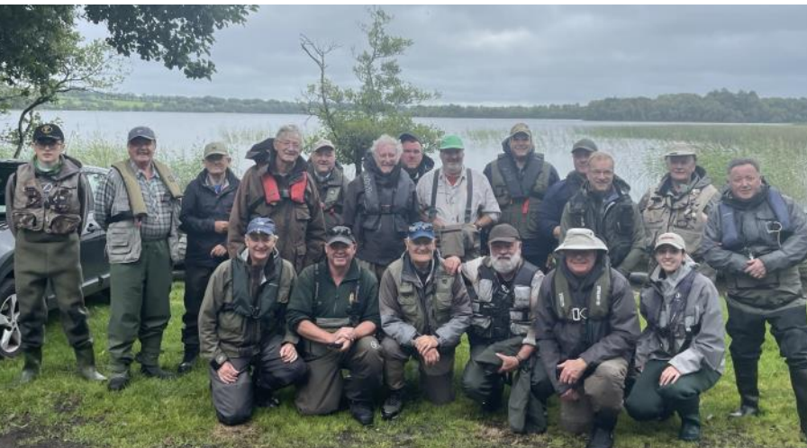
Elvery Cup, Lough Lene, 19th August '23