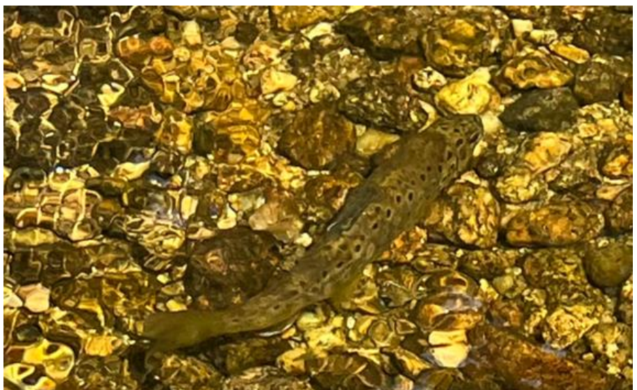
Kings River Brownie back on his way after taking small nymph