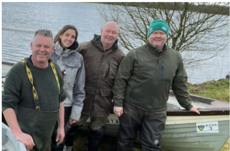
End of Season—Lifting the boats