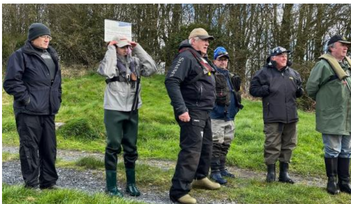
Anglers anticipation, Mc Carren Weigh-In, 23rd Sept '23